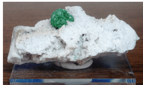
Variscite on quartz—Variscite ball is about 3/8" across, matrix about 2.5", for $100. (Sold.)

Variscite on Quartz, Canarana, Mato Grosso, Brazil. First time we’ve seen these! These have a similar radial structure to the cavansite, but with a pretty medium green color and a more spherical shape, like the one in the photo. We have only 4 left! All are on matrix: Two are thumbnail specimens, 1 for $20 and 1 for $40; One is on matrix about 1.75" across with a green variscite ball about 1/8" across for $30; One 2.25" matrix piece with 1/4" variscite sphere is available for $60.