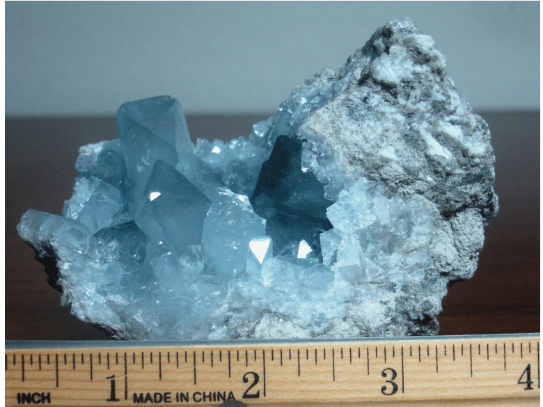
Celestite, Madagascar, $45 specimen.

Celestite , Sakoany Mines, Madagascar, our December 2000 featured mineral. The name comes from the Latin word for “heavenly,” in allusion to the sky-blue color its crystals often have. (Other common colors for celestite are white, gray, and colorless.) We picked up a nice lot of good-sized, heavy specimens (celestite contains the element strontium, one of the heavier elements) at the show last month in Costa Mesa, California. We have pieces that fit into 3" by 4" fold-up boxes for $30, $35, $40, $45, and $50, by size/quality. All the pieces have minor crystal bruising, probably from when they were collected.