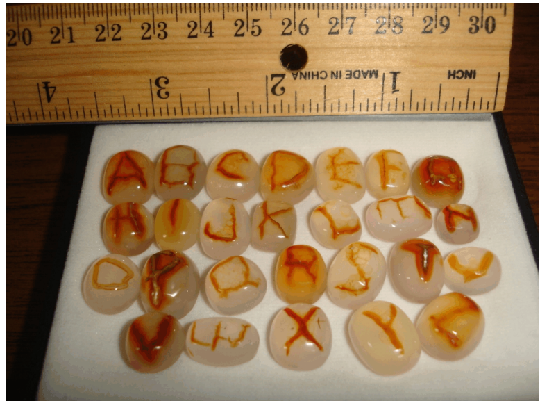
Alphabet Agate set from Indonesia. Yes, they are natural! Price upon request.

And we got some Tanzanite crystals from Tanzania, from $200 to $400. Email if you'd like a photo.