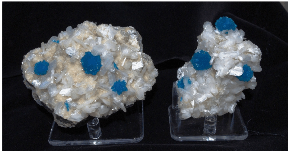
Cavansite on Stilbite, India.

Cavansite on Stilbite , Wagholi Quarry, Pune, Maharashtra, India. We have a source for excellent specimens of this gorgeous mineral that we featured in April 1996 and April 2006! We have matrix specimens like the one in the photo for $200, and $250. Email if you'd like to see more photos.