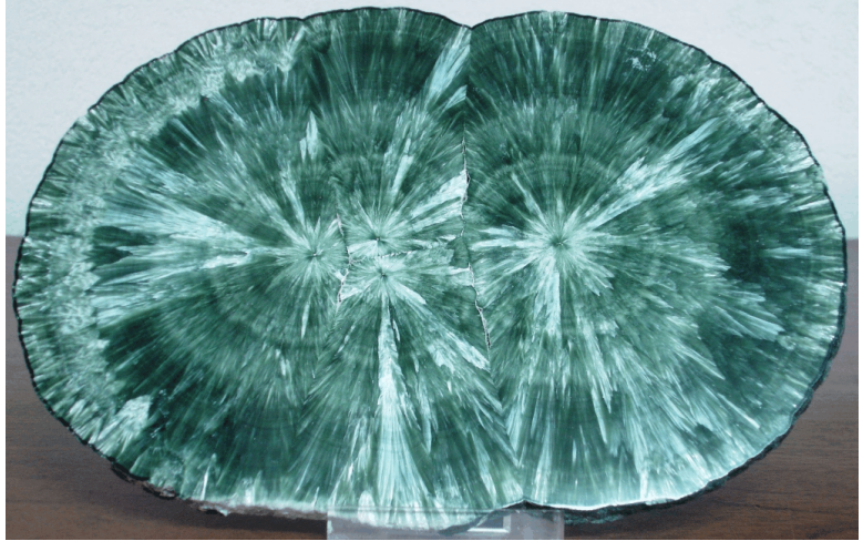
Clinochlore, var Seraphinite from Russia, a polished slice from a stalactitic formation! This piece is about 8.5" across. We have seven from $320 to $1050.

We picked up 7 more polished slices from this incredible new find! We shot a video of these pieces and put it on our web site so you can see them. We also made special pricing on the slices for Club members as you'll see when viewing the video.