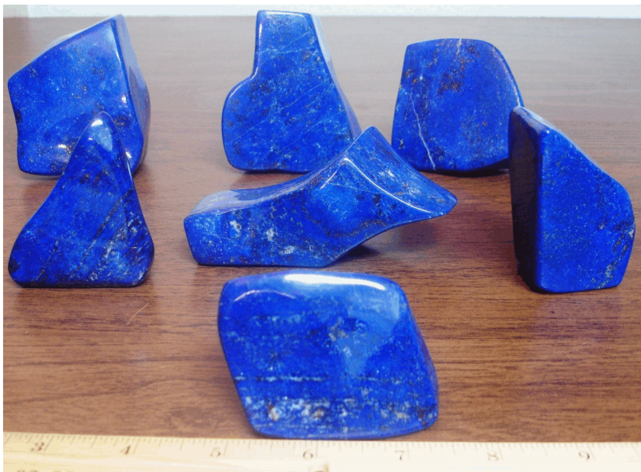
Polished Lapis Lazuli from Afghanistan. Ruler in front gives you an idea of their size. Front row piece: $60. Middle row, left to right: $80, $100, $80. Back Row: $160, $120, $120.

Lapis Lazuli , Afghanistan. These are polished pieces with the intense royal blue color and calcite and pyrite inclusions so beloved since its discovery millennia ago! We have three smaller pieces with wonderful color and pleasing shapes—each fits into a 2.5" by 2.5" fold-up box and is available for $60 and $80, by weight. We have 4 larger pieces that fit into our 3" by 4" fold-up boxes, for $100, $120, and $160, again by weight. A great companion piece to your lazurite crystal in matrix!