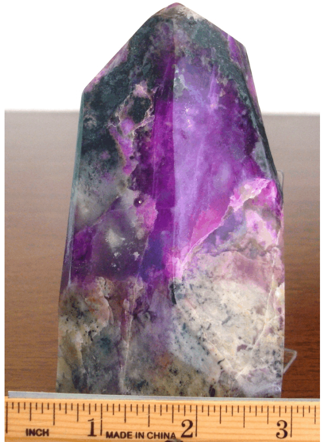
Sugilite in matrix, polished, from South Africa. 1 left for $375.

And speaking of rare beads, we got another lot of the beautiful and unusual Shattuckite beads we had a few years ago! We can send you an Email with information on them including a photo. They are available for a special price of $60 for Club members, with free shipping in the U.S. Email us and we'll send you the information and photo.