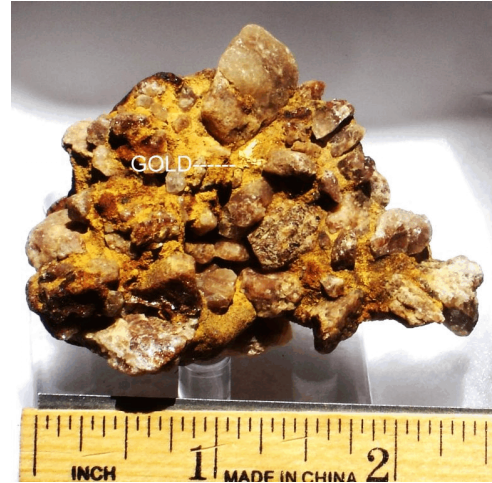
Can you see the word "Gold" pointing to the gold?

Gold in Conglomerate , Near Couto Magalhaes, Minas Gerais, Brazil. We have 3 left–pieces made up of little pebbles and quartz crystals naturally cemented together, each with a visible group of gold, still attached to the quartz it formed in! You'll need your 10x loupe to appreciate these, as the gold is only 1/8" across and slightly larger. Matrix about 2" by 1" to 2.5" by 1.75", for $70, $80, $90, by size of gold.