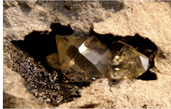
Close-up of vug containing Herkimer “Diamonds.” Amazing!

These are much larger than what we obtained 12 years ago. The smallest pieces consist of matrix about 4" to 6" across and about 4" high, each with a vug containing one or more excellent Herkimer “Diamonds” at least .5" across! These are available for $65, $75, and $95, by quality.